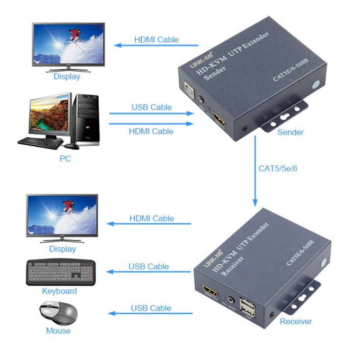
Note: This extender supports independent digital audio. If you do not need, you can connect it with the HDMI line to output video and audio.